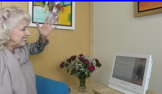
Video calls: Read lips and facial expressions